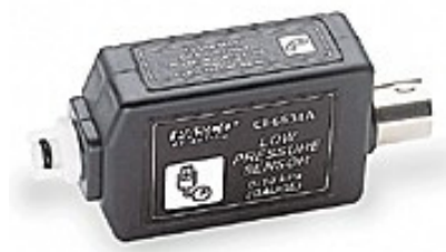
Fig. 3: Low pressure sensor (Pasco)

1. Secure the necessary equipment (computer with computer interface, low pressure sensor, graduated cylinder, and ruler).