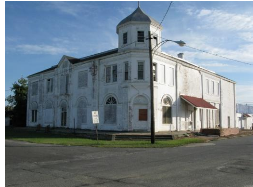
Old building in Helena, GA

Since we packed our youngest child off to college this past September, my husband and I have had time to pursue our passion of traveling the back roads of Georgia. No longer are we bound by the interstates to be near the fast food restaurants our kids love. Now we can follow the blacktops pulling our trusty camper behind us, stopping where and when we want to stop. The best trips are when we can combine my interest in Georgia history and my husband's interest in railroads.