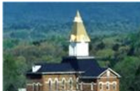
Price Memorial Hall at NGC&SU

View program details on the GAH web site . Registration form at the end of this newsletter.